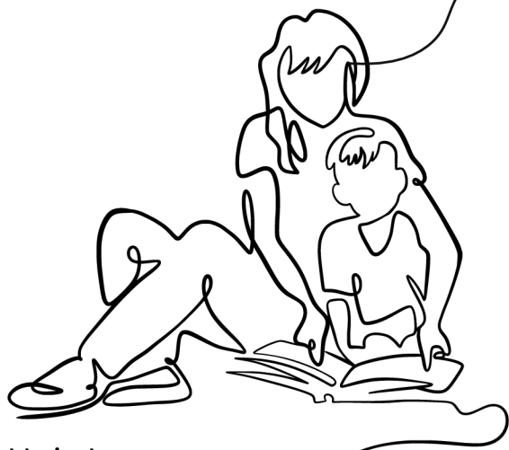
Huis Luca Housemother